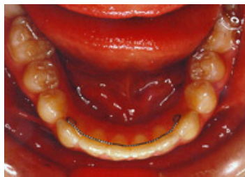
A fixed retainer

This will vary according to how your teeth originally looked, before the orthodontic treatment was started. However, as a general rule you will be asked to wear a removable retaining appliance for at least 6 months. This may mean wearing it all the time at first, before going on to just night-time wear. You will be advised if long term wear is required.